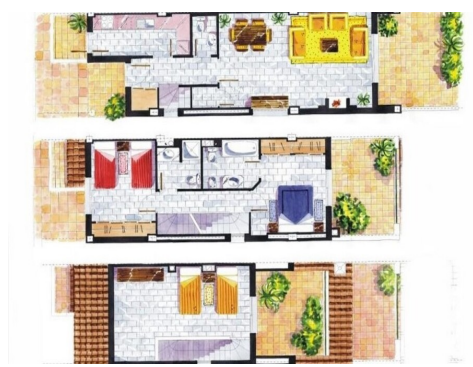
This information has been produced in good faith and is believed to be accurate based upon the information supplied by third parties and our own inspections and investigations, but it is not intended to form part of a contract. We apply our best efforts to verify the reliability of this information but cannot guarantee that it is accurate or complete, all data is subject to error and perspective clients should satisfy themselves by inspection or otherwise as to the correctness of each of the statements contained in these particulars.