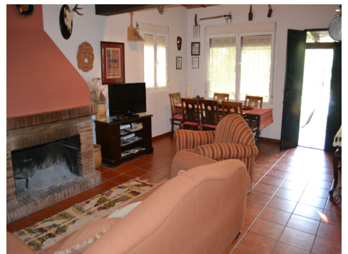
This information has been produced in good faith and is believed to be accurate based upon the information supplied by third parties and our own inspections and investigations, but it is not intended to form part of a contract. We apply our best efforts to verify the reliability of this information but cannot guarantee that it is accurate or complete, all data is subject to error and perspective clients should satisfy themselves by inspection or otherwise as to the correctness of each of the statements contained in these particulars.