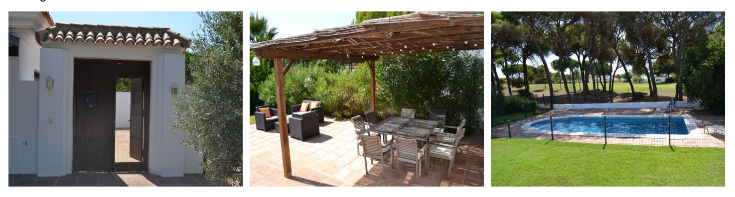
This information has been produced in good faith and is believed to be accurate based upon the information supplied by third parties and our own inspections and investigations, but it is not intended to form part of a contract. We apply our best efforts to verify the reliability of this information but cannot guarantee that it is accurate or complete, all data is subject to error and perspective clients should satisfy themselves by inspection or otherwise as to the correctness of each of the statements contained in these particulars.