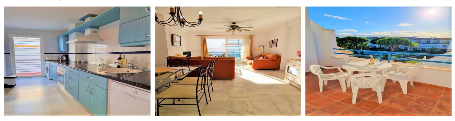
This information has been produced in good faith and is believed to be accurate based upon the information supplied by third parties and our own inspections and investigations, but it is not intended to form part of a contract. We apply our best efforts to verify the reliability of this information but cannot guarantee that it is accurate or complete, all data is subject to error and perspective clients should satisfy themselves by inspection or otherwise as to the correctness of each of the statements contained in these particulars.